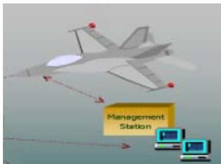
Figure 1 A sample application

The described features of a middleware cannot be implemented without software support. However, due to the stringent conditions of real-time embedded systems, what is known as the embedded software crisis, open distributed frameworks cannot be employed as easily as in enterprise systems. In other words, middleware solutions such as CORBA [18] and Java RMI, originally designed for enterprise systems, cannot be directly integrated into embedded systems due to the following reasons: